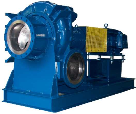
Wort pump London (Ontario, CAN) I16K-SS